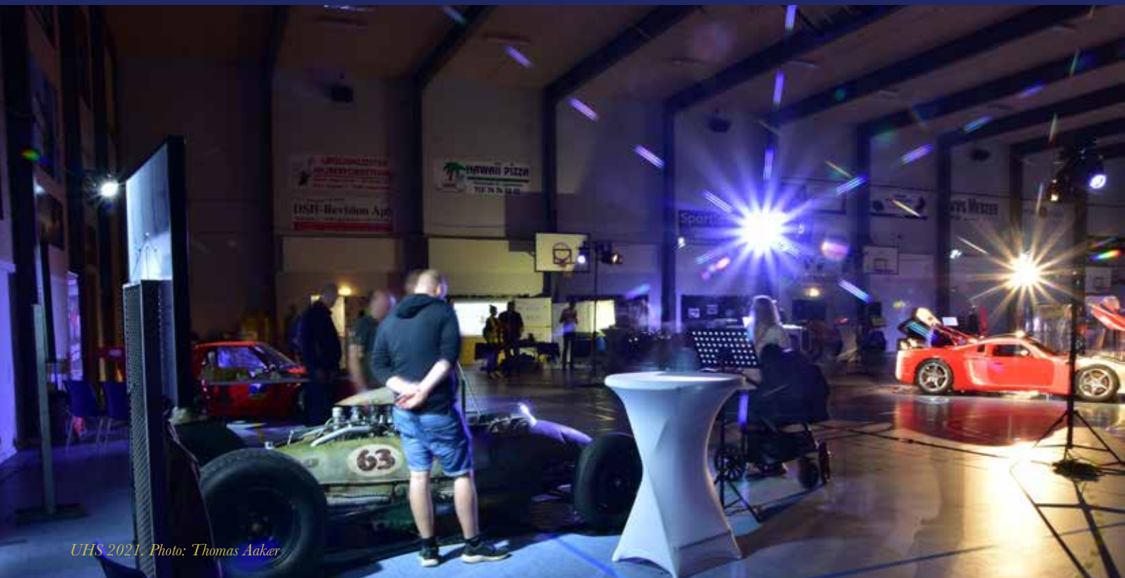
UHS 2021.