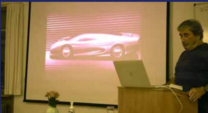
Kieth Helfet at UHS2021

The goal of being able to present around 20 projects is realistic to achieve, but it at the same time signals that the places as participants in the festival itself are also limited, so if you go with the dream of showing your car project to others than your family, who have given up on you as a dreamer and fantasist, then UHS-2025 is the right place to meet like-minded people, gather knowledge and experiences, and show a larger audience what you can achieve if you have the idea and the will to implement it.