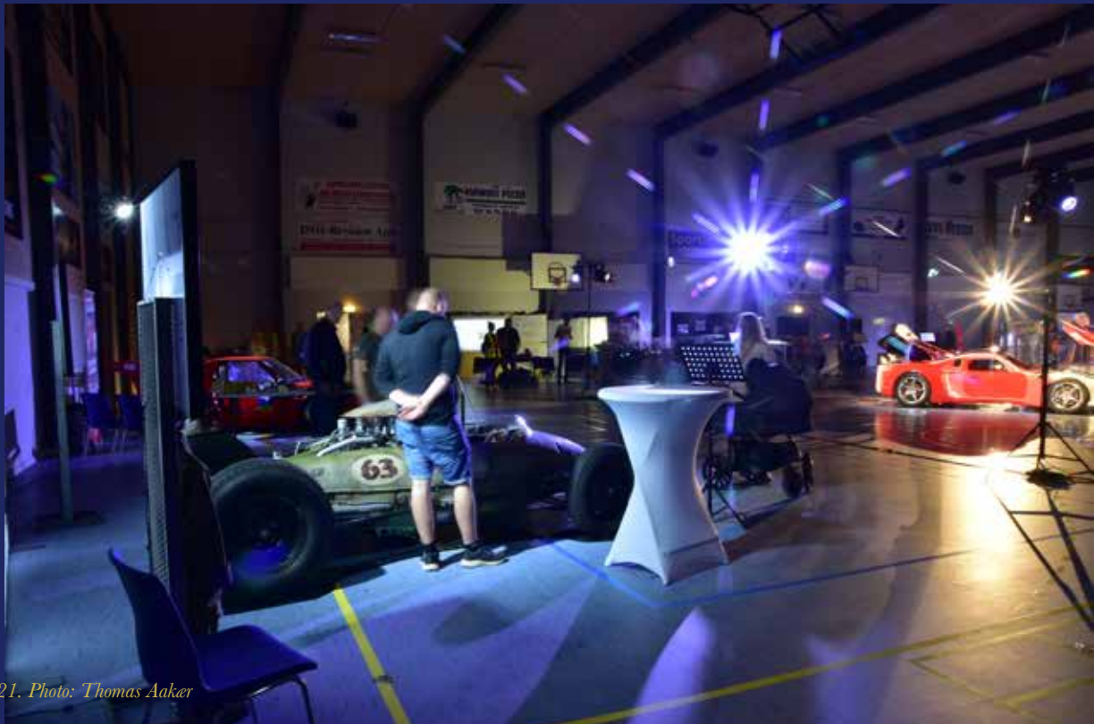
UHS 2021.