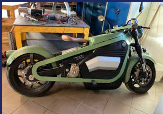
Above right: Nimbus now reinvented as an electric motorcycle designwise draws many parallels to the original Nimbus motorcycle.