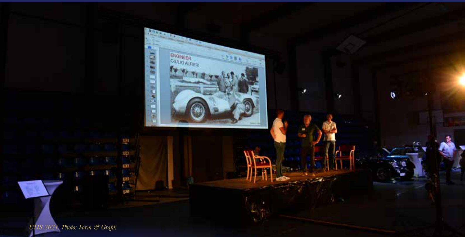
UHS 2021.