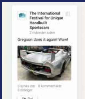
Example of newsrelay from Gregson Polska (UHS-2021 participant)

Design and construction projects are interesting subjects for all of us, and if you have a professionally manufactured product relevant to the hand building community, there is a sales opportunity by sharing your news with us (see example to the right).