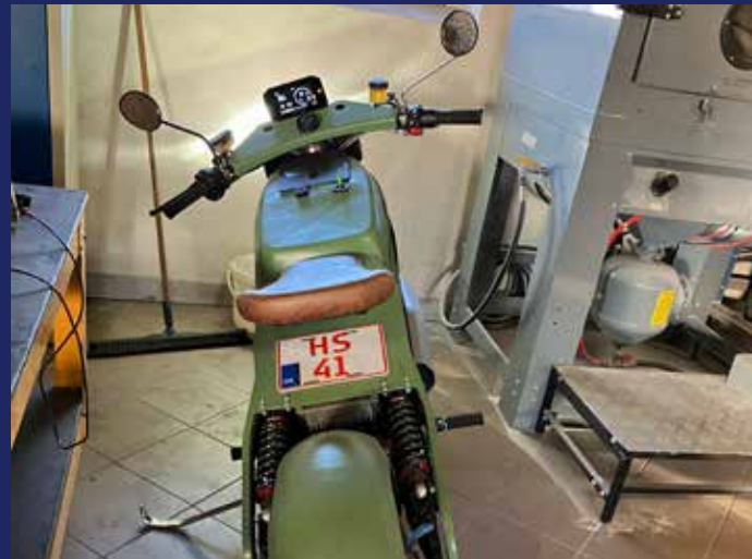
Here Dan Suenson stands with the Nimbus bicycle, which Aquila is a co-developer of. The frame is designed, tested and manufactured at Aquila.

Aquila Racing Cars also participated in UHS-2021, where we showed a CR1 and a Synergy race car, and you can read much more about it in the theme article that UNIQUEHANDBUILT.COM published in newsletter 2-2021 as well as in "UHS-2021 the magazine."