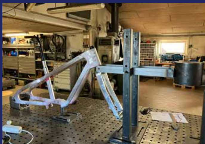
Above: The Nimbus bike frame being tested at Aquila Racing Cars.